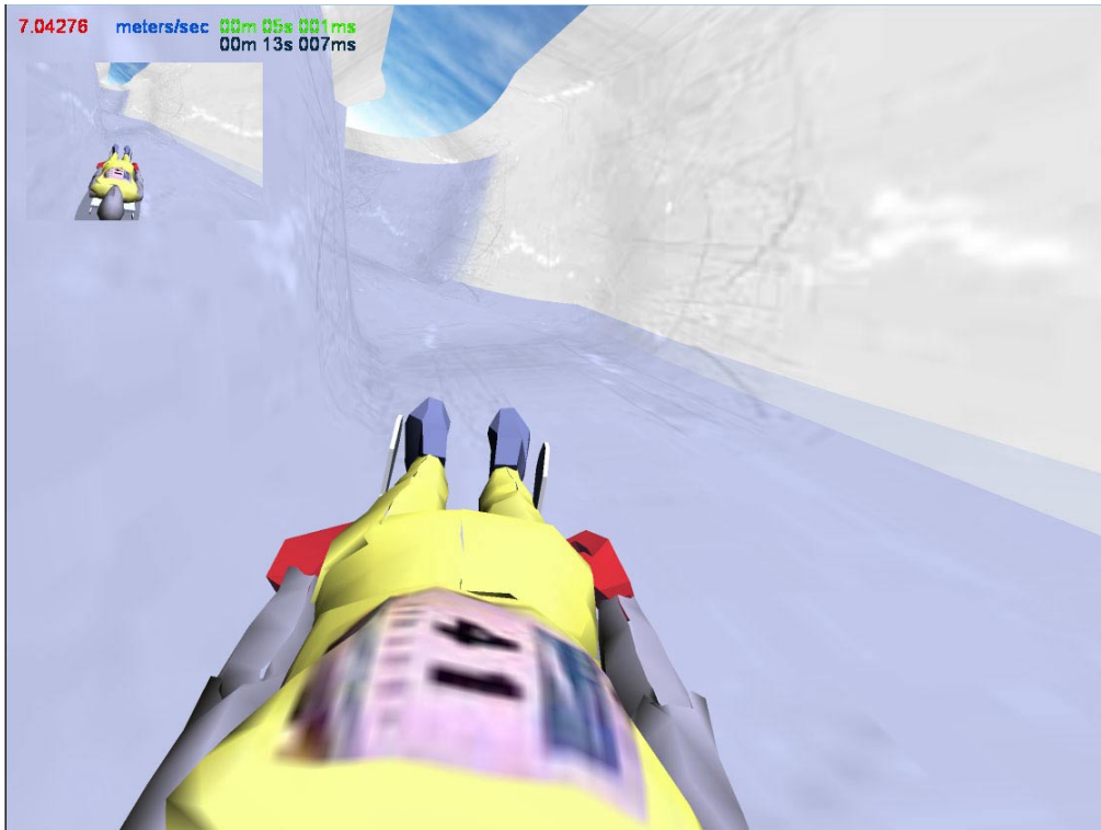
Figure 8. View of Display, Luge simulation, PC.