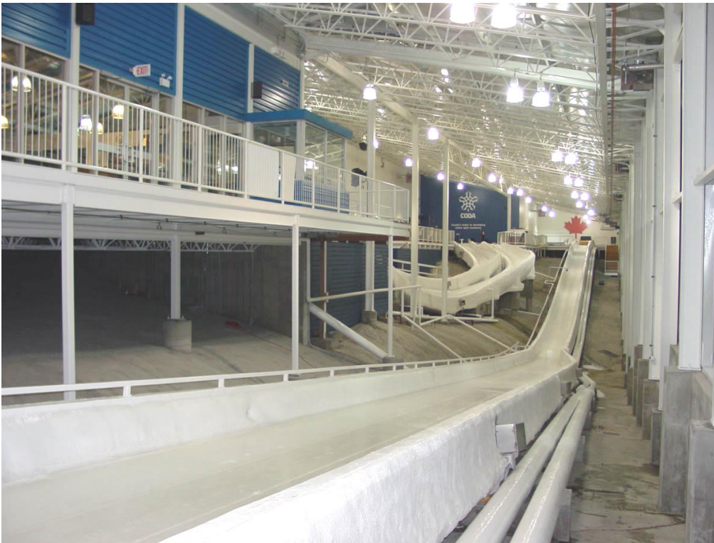
Figure 4. Ice House, Canadian Olympic Park, Calgary, Alberta.