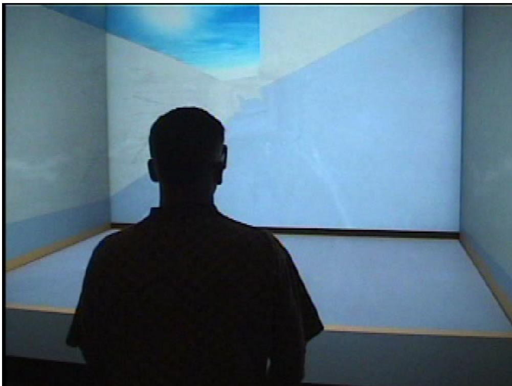
Figure 7. View of simulation in the CAVE, I-Centre, University of Calgary.