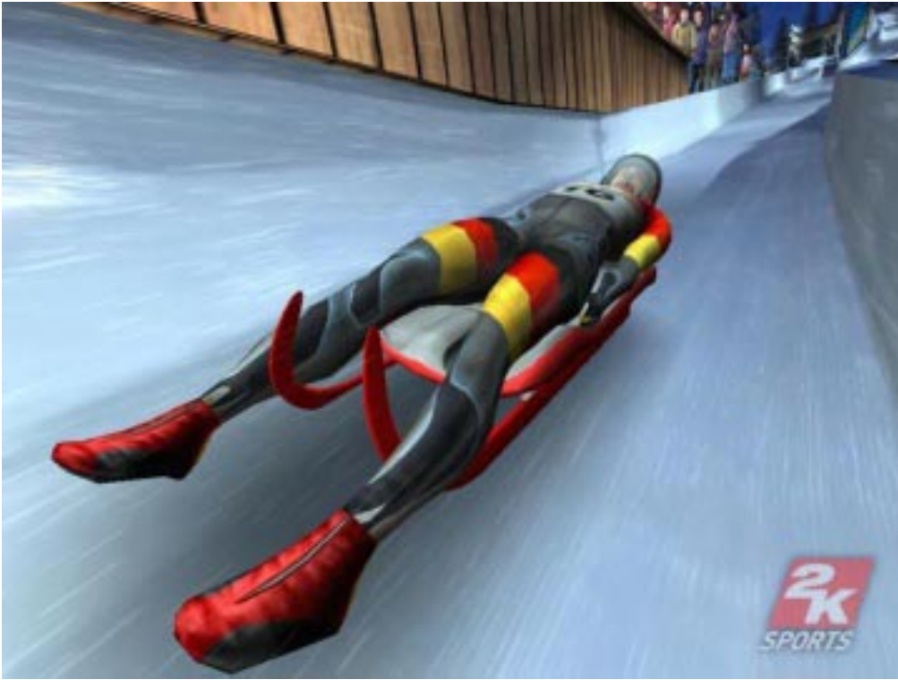
Figure 3. Image from “Torino 2006” 2K Sports.