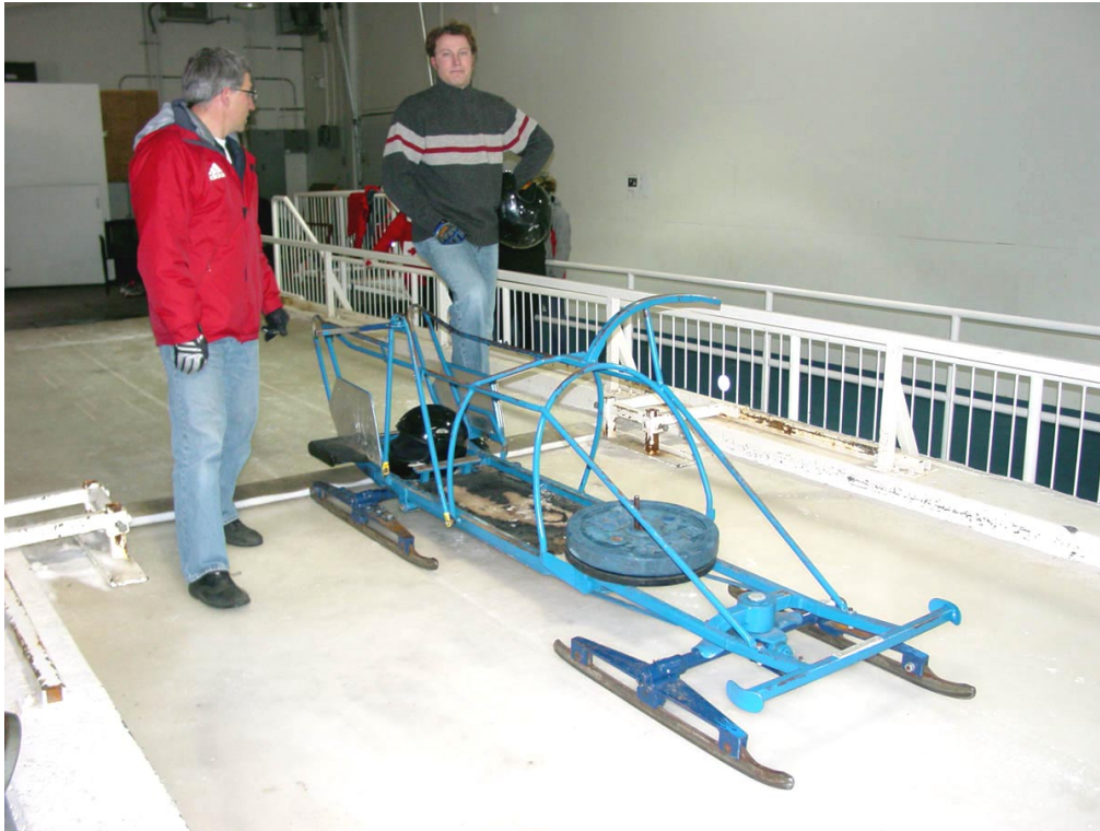
Figure 5. Test Sled Ice House, Canadian Olympic Park, Calgary, Alberta