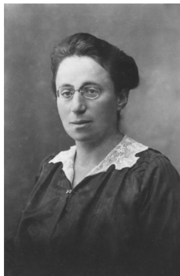
Figure bio.5: Emmy Noether

Emmy Noether (NER-ter) was born in Erlangen, Germany, on March 23, 1882, to an upper-middle class scholarly family. Hailed as the “mother of modern algebra,” Noether made groundbreaking contributions to both mathematics and physics, despite significant barriers to women’s education. In Germany at the time, young girls were meant to be educated in arts and were not allowed to attend college preparatory schools. However, after auditing classes at the Universities of Göttingen and Erlangen (where her father was professor of mathematics), Noether was eventually able to enrol as a student at Erlangen in 1904, when their policy was updated to allow female students. She received her doctorate in mathematics in 1907.