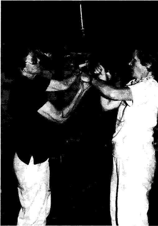
Fig. 2. Weighing a howler. A string is looped around the ankles and hooked onto the scale.

Corp., Costa Mesa, Calif., USA). This aluminum pole comes in 1.75-meter sections which can be bolted together until it is long enough to reach the darted animal. The pole has been used to reach animals 25 m up in trees.