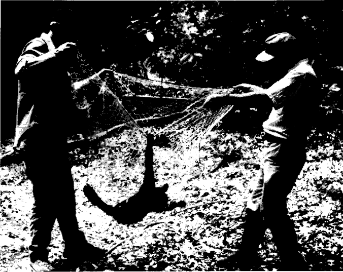
Fig. 1. A campers' hammock measuring 2 m wide by 2,5 m long is effective in catching darted animals as they free-fall from the trees.